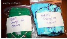
Extra set of clothes in a Ziploc bag •Pant, shirt, underwear, socks