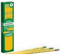
2 packs of Ticonderoga Pencils (24 total)