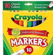
1 pack of thick markers