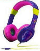
Headphones (NOT earbuds & not Bluetooth)