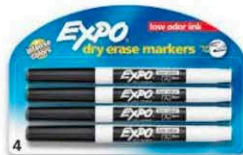
4 thin Expo dry erase markers (black)