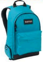
Full size backpack